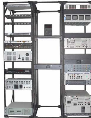
3 ganged 43RU Professional Series Racks with optional braces, drawers, & shelves