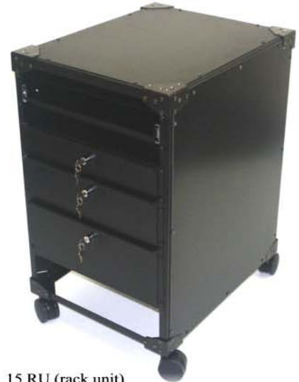
15 RU (rack unit) Rack with optional wheels, drawers, keyboard shelf, pvc side panels and steel top cover creates a lightweight, versatile and portable rack.