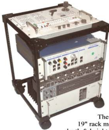
The "CUBE" - 19" rack mount width, depth & height, with front, rear, left, right, top & bottom access to 576 tapped 10-32 holes for racking 19" width rack mountable equipment.

3 precisely engineered parts when connected together form Wiggle-Free equivalent strength and integrity of fully assembled welded rack enclosures.