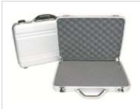
★ OALUMNCP102 ★

Compact Size Laptop/Notebook Case Premium Grade Polished Aluminum Finish - Immediate Availability - Ingenious Laptop Securing System - Handsome Good Looks - Reasonable Pricing - Lightweight Convenient Design - Shoulder Strap - Useable Interior Space - 13-1/4"x9-1/2"x3" (wdh)