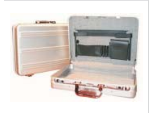
★ OALUMNDM106 ★

Multi-Purpose Foam-Filled Case Premium Grade Polished Aluminum Finish - Immediate Availability - Dived (pick n' pluck) foam bottom with convoluted foam in lid - Handsome Good Looks - Lightweight Design - Useable Interior Space - 16-3/4"x12-1/4"x3" (wdh)