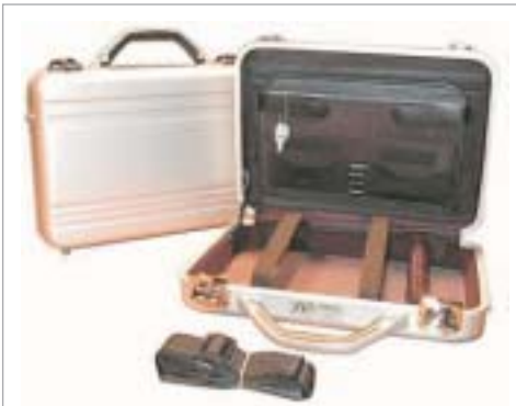
★ OALUMNCP101 ★

Compact Size Laptop/Notebook Case Premium Grade Polished Aluminum Finish - Immediate Availability - Ingenious Laptop Securing System - Handsome Good Looks - Reasonable Pricing - Lightweight Convenient Design - Shoulder Strap - Useable Interior Space - 13-1/4"x9-1/2"x3" (wdh)